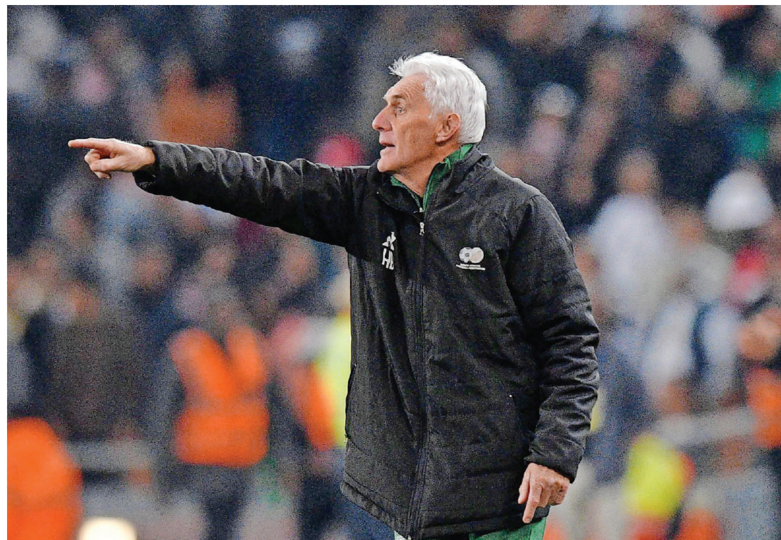
HUGO Broos wants to see a better display from Bafana Bafana against Ivory Coast today.